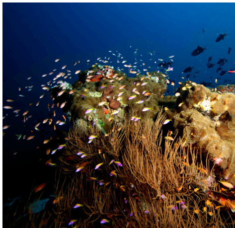
ACTIVE MARINE LIFE